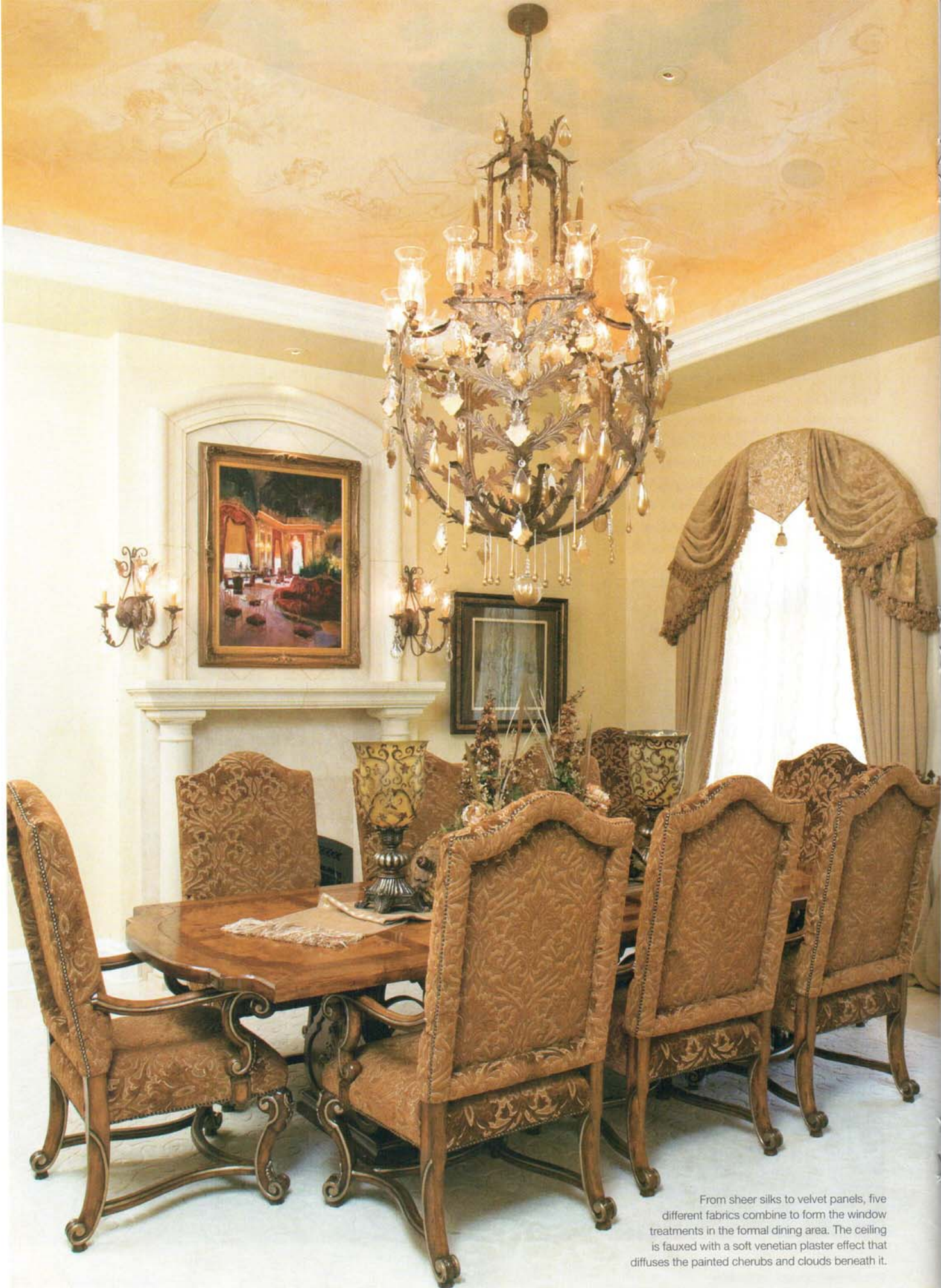
From sheer silks to velvet panels, five different fabrics combine to form the window treatments in the formal dining area. The ceiling is fauxed with a soft venetian plaster effect that diffuses the painted cherubs and clouds beneath it.